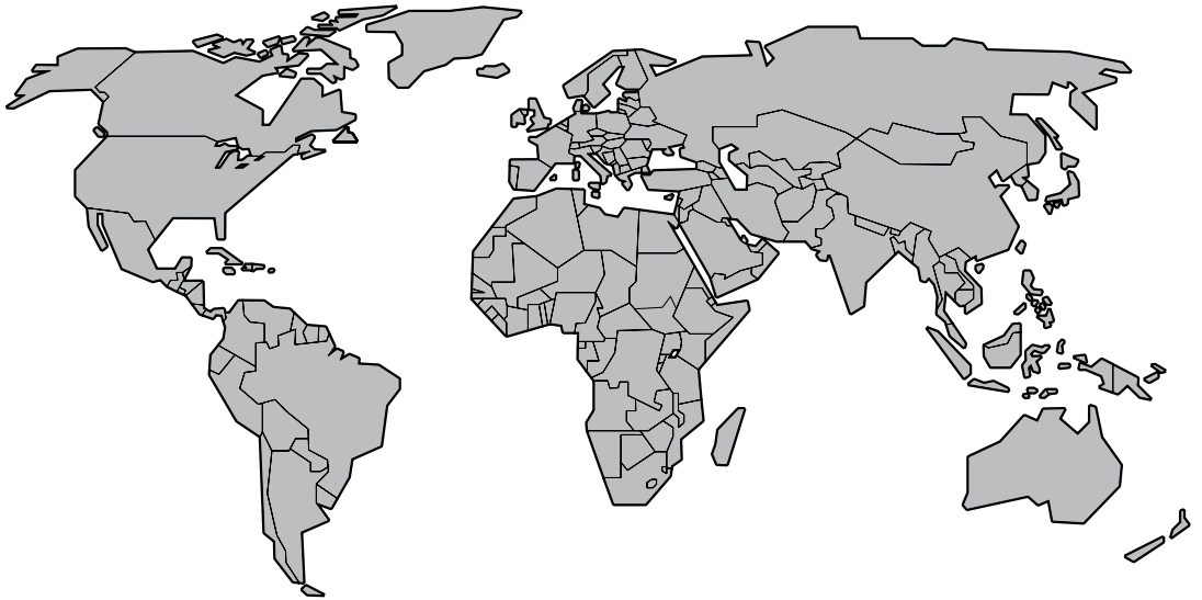
Figure 1. Figure whole page wide with transparent background.