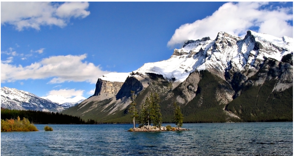
Figure 2. Figure whole page wide without transparent background.